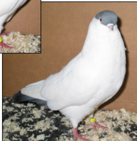
Champion MFPH Blue YC #1232 Exhibitor: Bob Bollinger