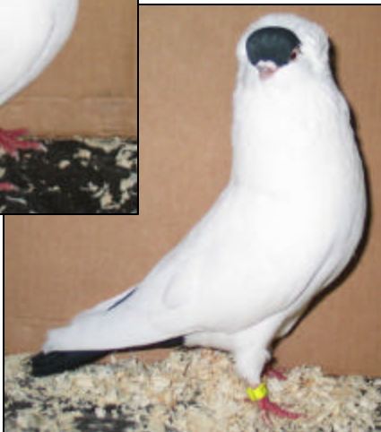
1st Reserve MFC Black YC #2145 Exhibitor: Mike Crawford