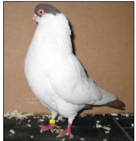
Champion SFPH Red YH #617 Exhibitor: Vic Eshpeter