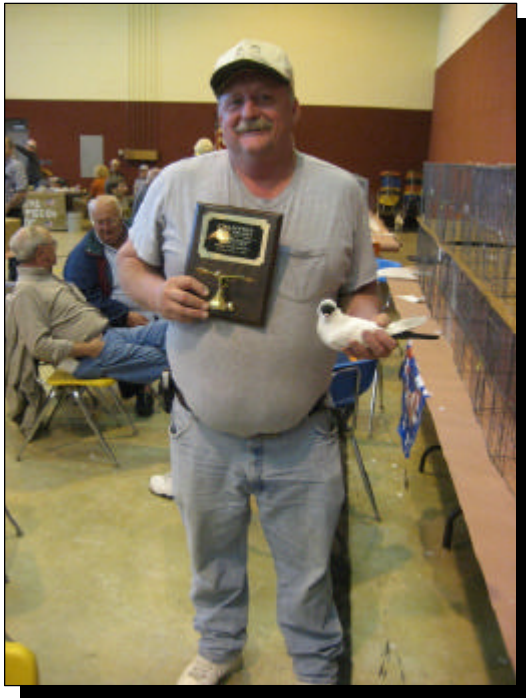
Victor Cline Champion Medium Face Crested