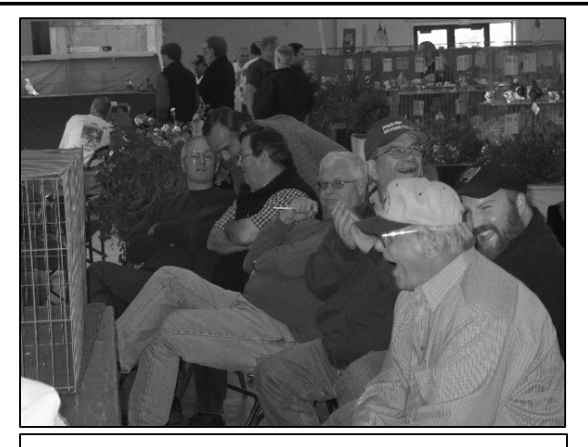
Helmet folks enjoying the Auction action!