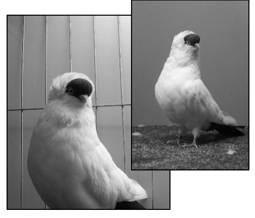
Champion Black OH