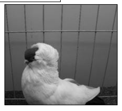
First Reserve Black OC