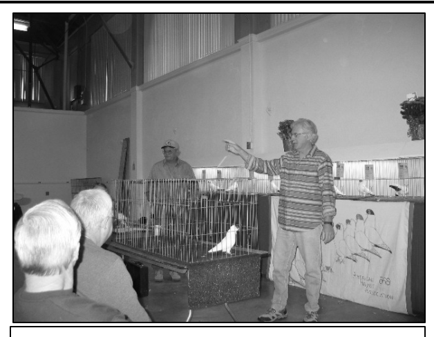
A.H.A. Auction on Saturday

Anyway, if you enjoy different dimensions of excitement at a pigeon show, this Western Sectional really delivered. And in the end we replenished the purse out of the 10% to the club, which is just waiting for the next time we decide to do it again. Good luck at the National; see you there.