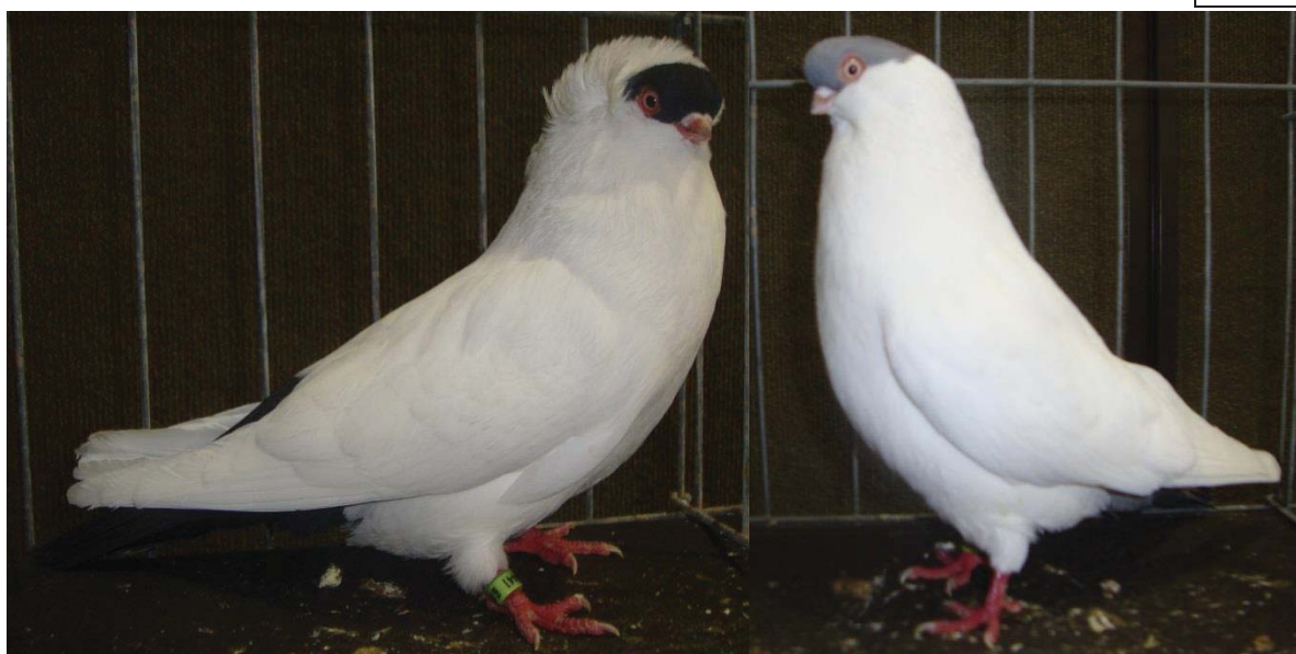
2014 National MFPH Champion (Lower right)