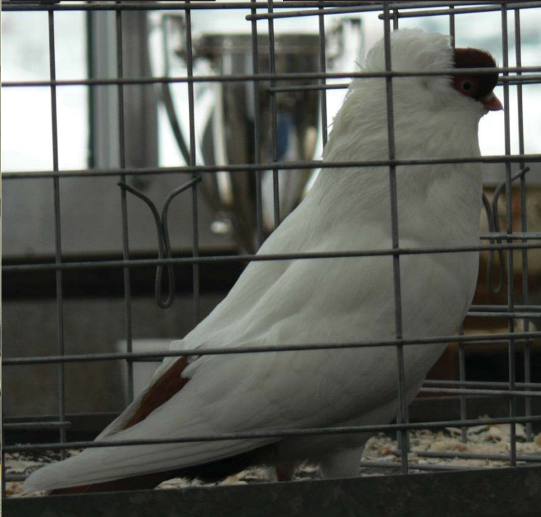
Sarnia 2013 MFC Champion (Below)