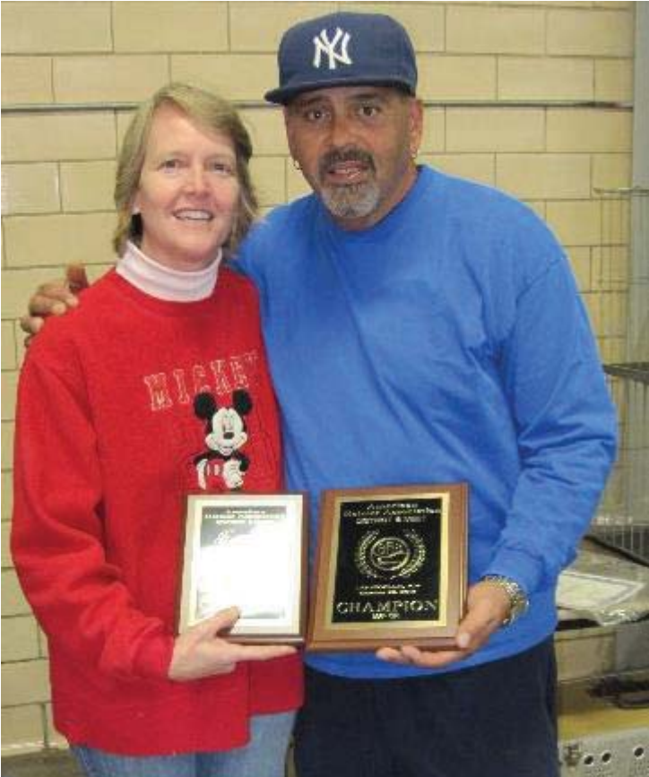
NYBS 2013 Champions (On left)